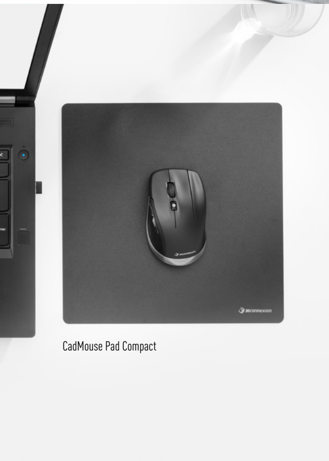
CadMouse Pad Compact

Dedicated Middle Mouse Button – the days of clicking the mouse wheel are over thanks to the CadMouse's intelligent ergonomic design.