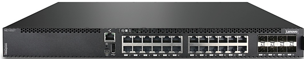
Figure 1. Lenovo ThinkSystem NE1032T RackSwitch

The Lenovo ThinkSystem NE1032T RackSwitch is shown in the following figure.